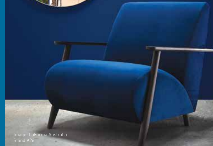
Image: LaForma Australia Stand K26

Australia's premier destination for the furniture industry